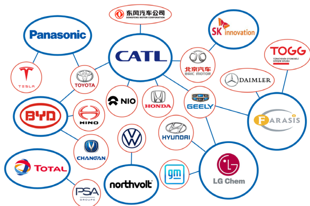
FIGURE 4 – MAJOR OEMS JVS WITH BATTERY MANUFACTURERS