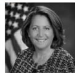
Lisa Monaco Deputy Attorney General, U.S. Department of Justice